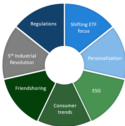
Chart 3: Seven key drivers behind change in sentiment towards Asian small caps

However, the past two years have seen several market developments converge, with previous headwinds now becoming tailwinds for small caps. We have identified seven key drivers behind this change in sentiment, such as an evolving regulatory environment, the shift in focus among ETFs toward smaller companies, increasing personalization, changing consumer trends, friendshoring due to US-China rivalry, the advent of the fifth industrial revolution and lastly beneficiaries of environmental, social, and governance (ESG).